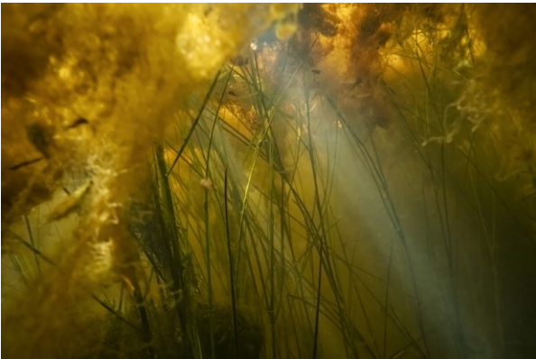
Unter Wasser # 64 Under Water # 64