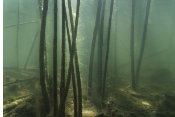
Unter Wasser # 6 Under Water # 6