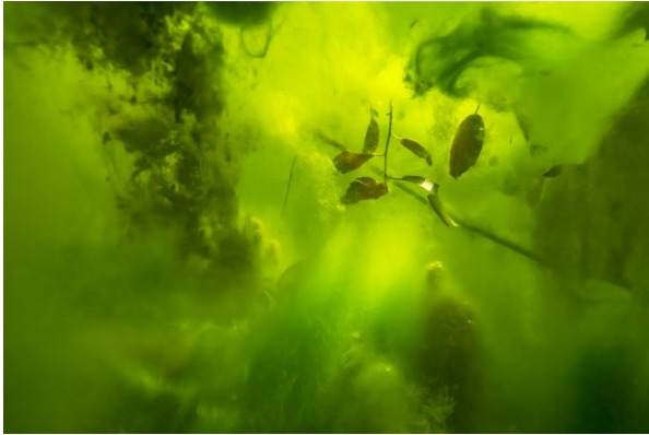
Unter Wasser # 17 Under Water # 17