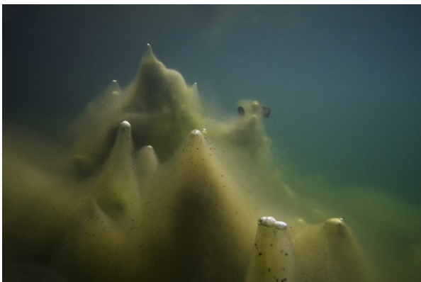
Unter Wasser # 38 Under Water # 38