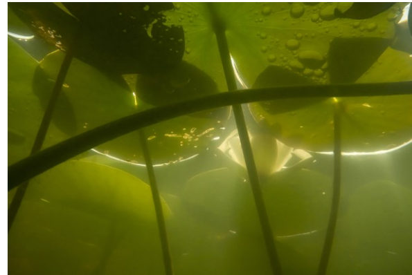
Unter Wasser # 53 Under Water # 53