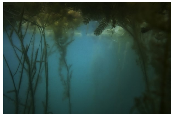
Unter Wasser # 59 Under Water # 59